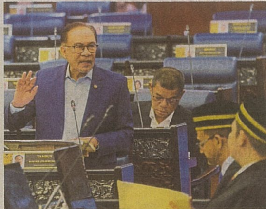
Anwar pada sesi soal jawab di Sidang Dewan Rakyat, semalam.

Memperincikan kerelevanan perubahan kadar SST, Anwar berkata, ia terpaksa dibuat bagi mengelak ekonomi negara men-