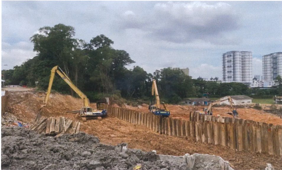
Kerja pemasangan cerucuk giat dijalankan di kawasan tanah runtuh dekat Jalan Wawasan, Taman Wawasan, Puchong pada 3 Januari 2024.