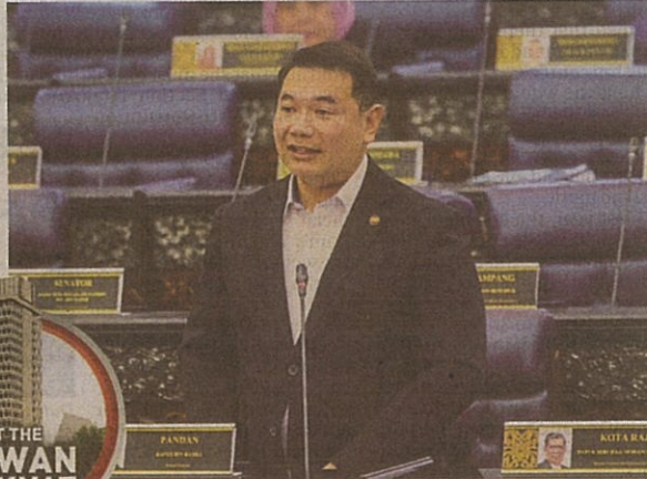
Economy Minister Rafizi Ramli answering a question in the Dewan Rakyat yesterday.