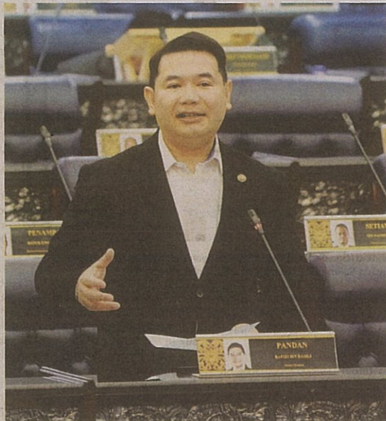
RAFIZI ketika menjawab pertanyaan di Dewan Rakyat, Kuala Lumpur semalam.

"Saya tidak pernah maklum mengenai perkara ini kerana ingin melindungi keselamatan sistem. Bagaimanapun, sekiranya ditanya sama ada data sudah encrypted atau tidak, itu sudah kita lakukan," katanya pada sesi Waktu Pertanyaan-Pertanyaan