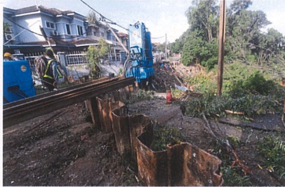
Contractors installing sheet piles to control soil movement at the site in Taman Wawasan, Puchong, after a landslide last December.