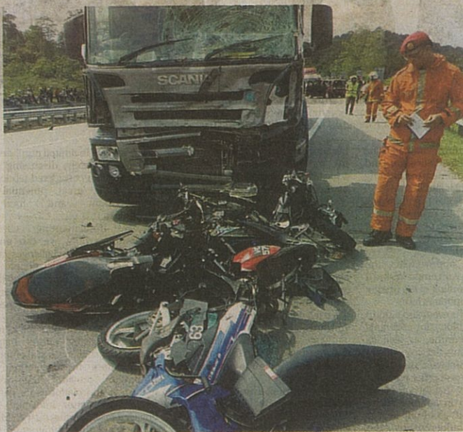
Motorcyclists are vulnerable to serious injuries during a crash, recording the most fatalities at 67.45% in 2023.

"There is a high chance workers will pay heed to their employer's call since they are their paymasters and know them well. Thus, the employee's road safety behaviour can be modified from unsafe to safe."