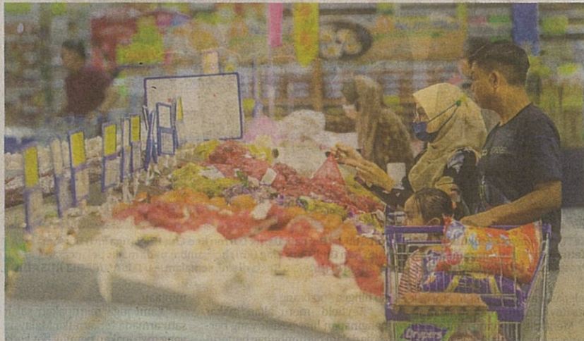
PELARASAN cukai perkhidmatan dan jangkakan pelarasan subsidi diesel dijangka memberi kesan kepada kadar inflasi semasa. - GAMBAR HIASAN

"Magnitud sebenar risiko peningkatan akan bergantung kepada beberapa faktor utama seperti tarikh kuat kuasa pelaksanaan untuk rasionalisasi subsidi bahan api, kuantum