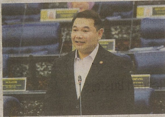
Rafizi ketika sesi soal jawab Pertanyaan-Pertanyaan jawab Lisan pada Sidang Dewan Rakyat di Bangunan Parlimen pada Selasa.

Kementerian Ekonomi mendedahkan lebih dua juta cubaan menembusi ciri keselamatan sistem Pangkalan Data Utama (PADU) pada bulan pertama ia diperkenalkan.