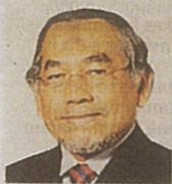
Pakar Ekonomi Universiti Sains dan Teknologi Malaysia (MUST)

• Kesan inflasi dan kenaikan kos sara hidup tidak boleh diambil ringan dalam melaksanakan satu polisi besar seperti penghapusan subsidi petrol dan diesel ini