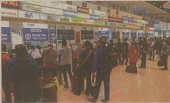
It's that time of the year: Long queues to purchase tickets for the Hari Raya festivities seen at Terminal Bersepadu Selatan (TBS).

"Tickets have been open for booking since early this month.