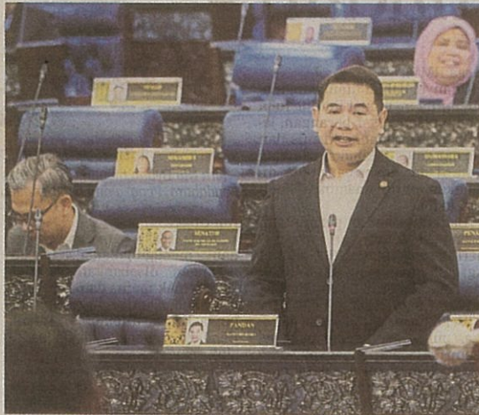
Rafizi pada sesi soal jawab di Dewan Rakyat, semalam.

Beliau menjawab soalan Datin Seri Dr Wan Azizah Wan Ismail (PH-Bandar Tun Razak) mengenai langkah kawalan data PADU daripada disalahgunakan.