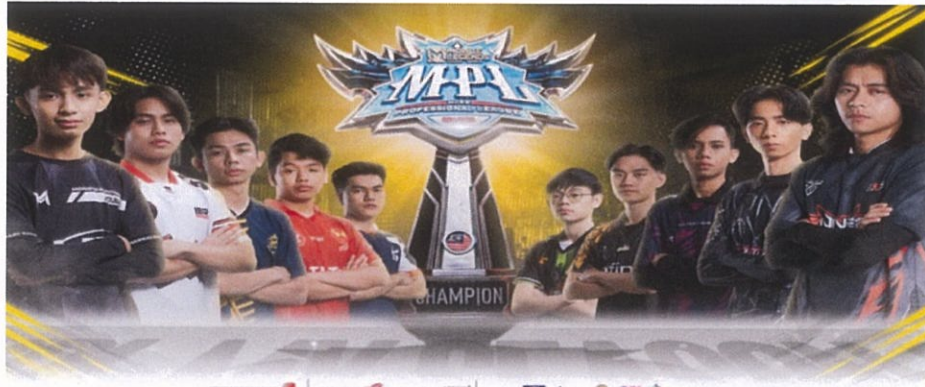
MPL Malaysia season 13 is set to run from March 29 to May 12.

KUALA LUMPUR: Much is at stake for teams competing in the 13th season of Mobile Legends: Bang Bang Professional League Malaysia (MPL MY), which will run from March 29 to May 12.